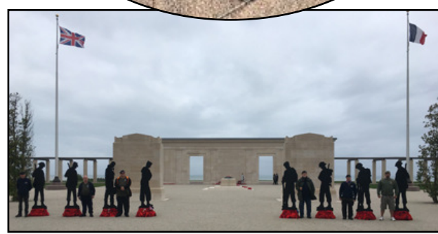
British Normandy Memorial