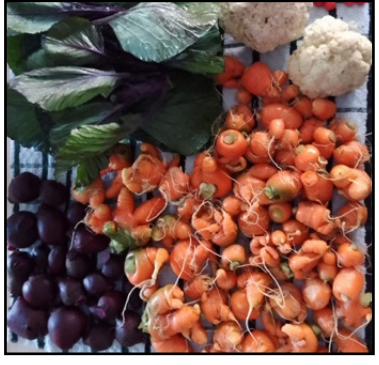
Cabbage leaves, beetroot, cauliflowers and carrots were harvested from our allotment by volunteer Jack. The ground is now being