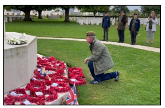
Bayeux War Cemetery